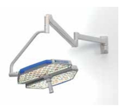
Wall-mounted version: ideal for special infrastructure conditions and procedures