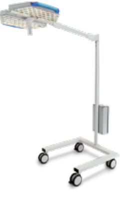
Mobile version: for emergencies or supplemental use