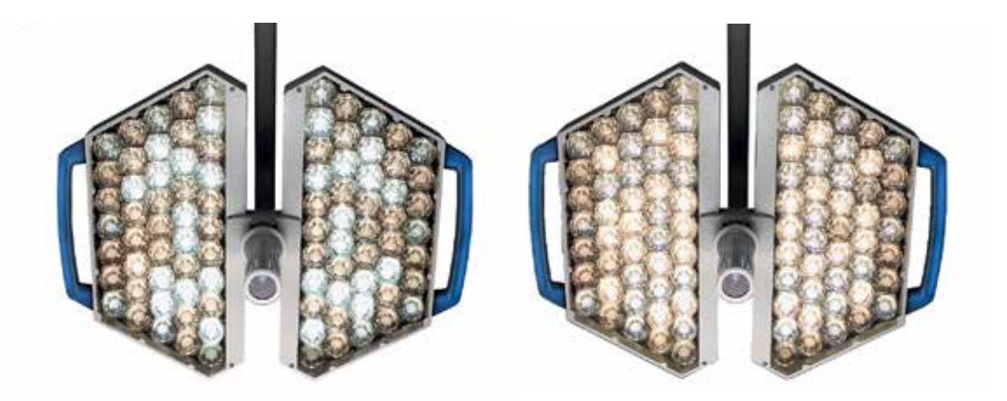
Contrast optimization due to color temperature adjustment of 3,500 to 5,000 K

Every generation has an edge over the previous one. Similarly, in the case of the TL5000 Surgical Light, proven functionality meets technological advancements that have significant impact on the quality of work in the OR. Equipped with adjustable color temperature and pattern size adjustment, the TL5000 Surgical Light offers an exceptional performance range that benefits you during daily use.