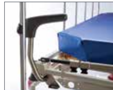
Ergonomic Push Handles with Exclusive IV Pole Holder