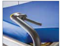
Active Hand Brake