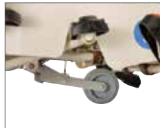
Steering Plus™ System