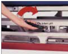
Cassette Locking Lever

A safe and comfortable experience for both you and your patient starts on a Hill-Rom® stretcher.