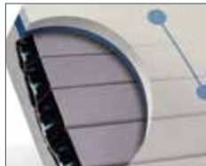
AccuMax® VPC Surface